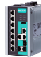
EDS E Series Industrial Ethernet Switches

Building reliable and secure networks to maintain your business operations