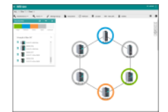
MXview Series Industrial Network Management Software