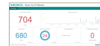
Security Dashboard Console Security Management Software