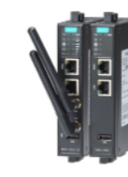
Moxa Remote Connect Suite Secure Remote Access