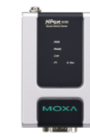
NPort 6000 Series Industrial Secure Terminal Servers