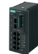
IEF-G9010 Series Industrial IPS Firewall