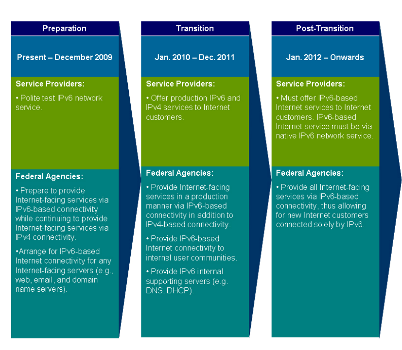
Chart 3: IPv6 Transition Phases and Timeline in US Federal Agencies