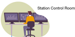
Station Control Room

To cope with diverse operating environments and conditions at the metro stations, the BXP-A100-E2 computer comes with a fanless and unique heat-dissipation design to support operations at temperatures -30 to 60°C for long-term stability and reduced maintenance costs.